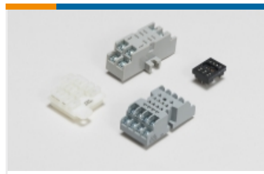
Relay Accessories, Sockets & Clips(12)